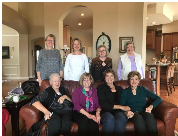
LWV-BA Board met Feb. 3

http://www.galvestonvotes.org/2018_Elections/Primaries/index.html